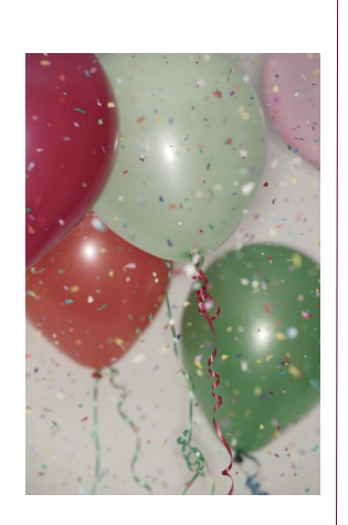
This month, join us in celebrating these members for their contributions, milestones and achievements.