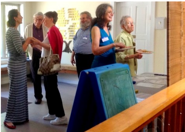
Congregants of all ages were in attendance, with younger guests making paper shofars to prepare for the holidays.